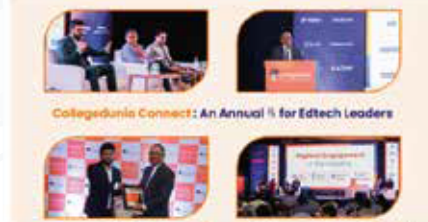
Collegedunia Connect is a platform that addresses thought leaders and change makers in the education sector. It is a Higher Education Summit that brings together key stakeholders including educationists, industry leaders, etc. This year at Collegedunia Connect 2.0 The Delhi Chapter, the theme is 'Shaping the Future'. This year we are going to be more productive, discussing emerging trends in education system in India. The event is a key initiative of Collegedunia, an online platform for education professionals, and is a part of its mission to create a global network of education leaders.