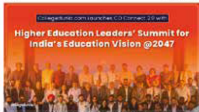
Collegedunia Connect 2.0 is a platform for thought leaders and stakeholders in the education sector to discuss and shape the future of education in India. The event is a key initiative of Collegedunia, an online platform for education professionals, and is a part of its mission to create a global network of education leaders.